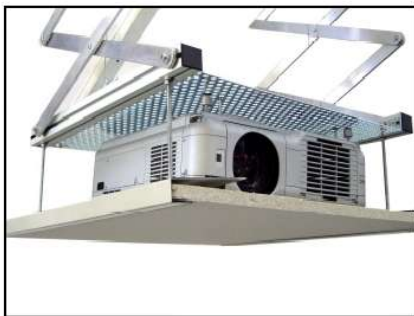
FALSE CEILING FIXING SYSTEM

The SI-200 is supplied with an extremely SILENT Somfy® motor that allows a descent from a minimum of 20 cm. to a maximum of 196 cm.