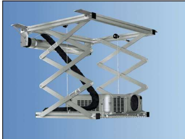
PROJECTOR LIFT PARTLY OPEN

The projector lift SI-200 is a versatile and innovative product that enables the installation of the projectors in environments where particular aesthetical solutions are needed.